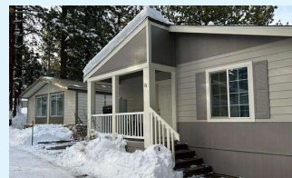
Sierra Holiday MHP $5.4M Mammoth Lakes, CA