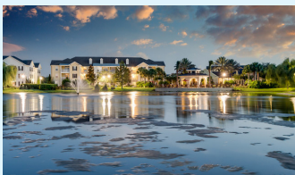
The Baldwin $48.8M Orlando, FL