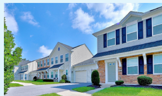
Morgan Portfolio $129.9M Various Locations