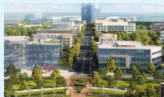
Navy Yard Portfolio $150M | Fixed Life Science Philadelphia, PA