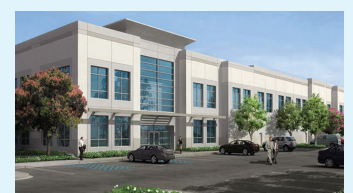
Watson Industrial Portfolio $97.5M | Fixed Industrial Southern California