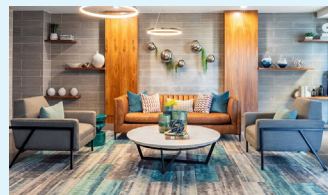
Valley & Bloom $87.1M | Fixed Multifamily Montclair, NJ