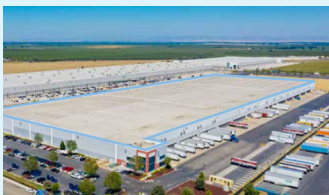
Core Logistics Portfolio $250M | Fixed Industrial Multi-State