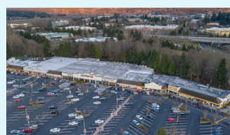
Bear Creek Village $31M | Floating Retail Redmond, WA