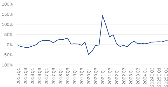
As of December 31, 2024. YoY = Year over Year. Source: FactSet. Forecasts may not be achieved and are not a guarantee or reliable indicator of future results.