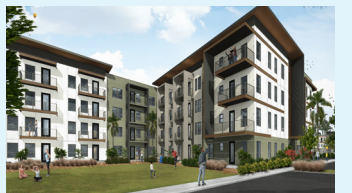
Lake Maggiore Apartments $26.5M | Structured – Preferred Equity – Development Multifamily St. Petersburg, FL