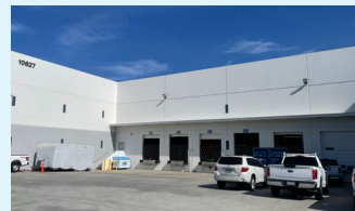
Industrial Portfolio $49.8M | Core Plus – Senior Industrial Various Locations