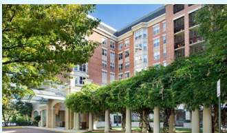
Project Brighton $277.5M | Core Plus – Senior Health Care Senior Living Various Locations