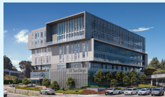
Campus on Villa La Jolla $133.5M | Core Plus – Senior Medical Office San Diego, CA