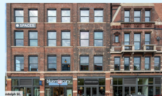
Fulton Market Portfolio $100.9M | Core Plus – Senior Mixed Use – Retail & Office Chicago, IL