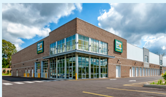
Metro Self Storage $35.0M | Core Plus – Senior Self-Storage Various Locations