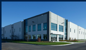
Industrial | Chicago, IL $50 Million Senior