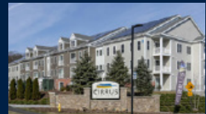
Multifamily | Boston, MA $105 Million Senior