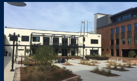
Creative Office | Atlanta, GA $37 Million Senior