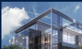
Office | Santa Monica, CA $100 Million Senior + Mezzanine