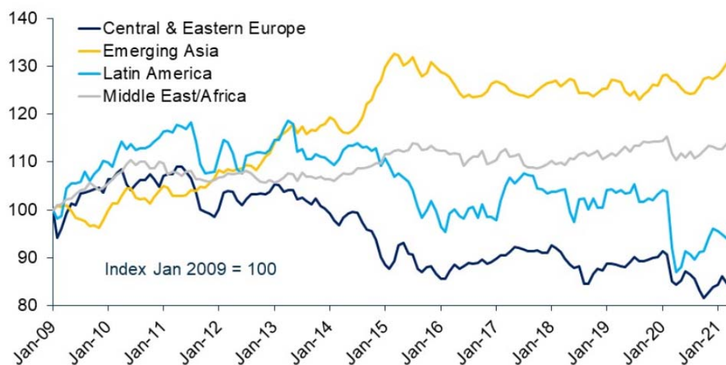
FIGURE 3: LATAM AND CEE REAL EFFECTIVE EXCHANGE RATES APPEAR WELL BRACED FOR POTENTIAL TAPER-RELATED VOLATILITY